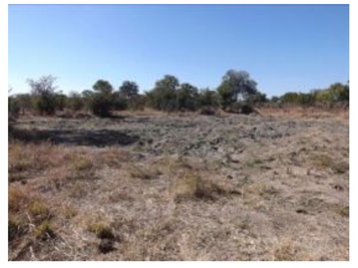
No 5 Pan before.....