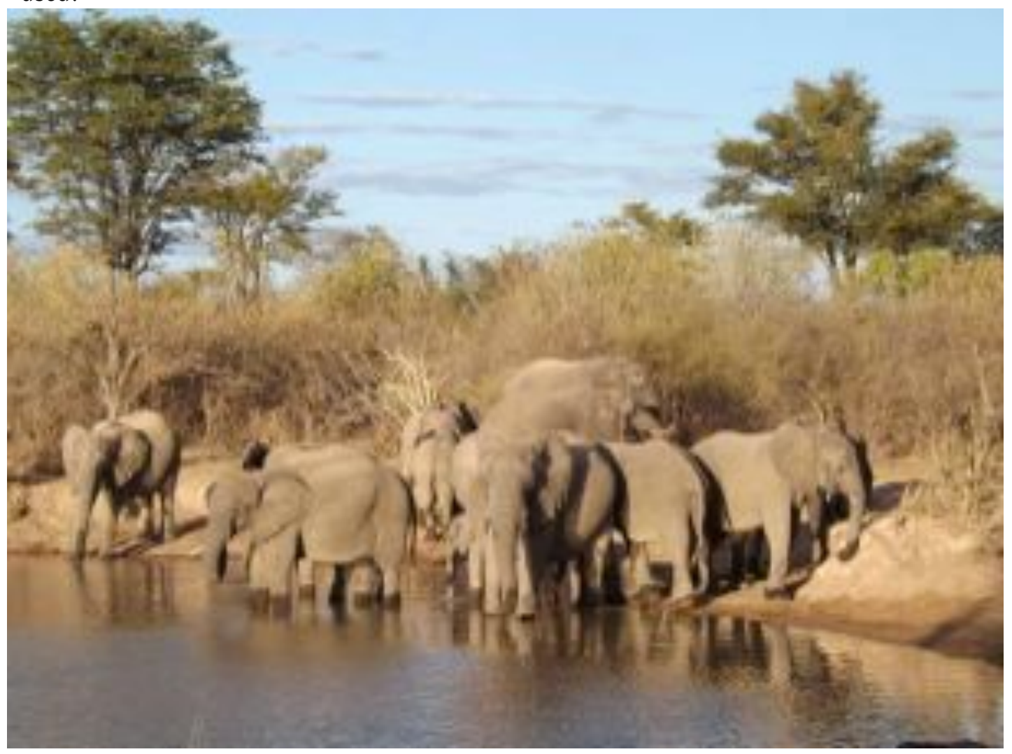
Elephants enjoying the good water remaining at a natural pan near Sinamatella Camp.

There is still very good natural water around the whole Sinamatella sector. At the pumped pans, Masuma, Shumba and Baobab are still excellent. We were finally able to re-connect the wind pump at Shumba in mid month and it is contributing a significant flow of water to the pan though elephants continuously interfere with the outlet pipe. Inyantue is not yet being pumped but it has plenty of water and seems to be heavily used.