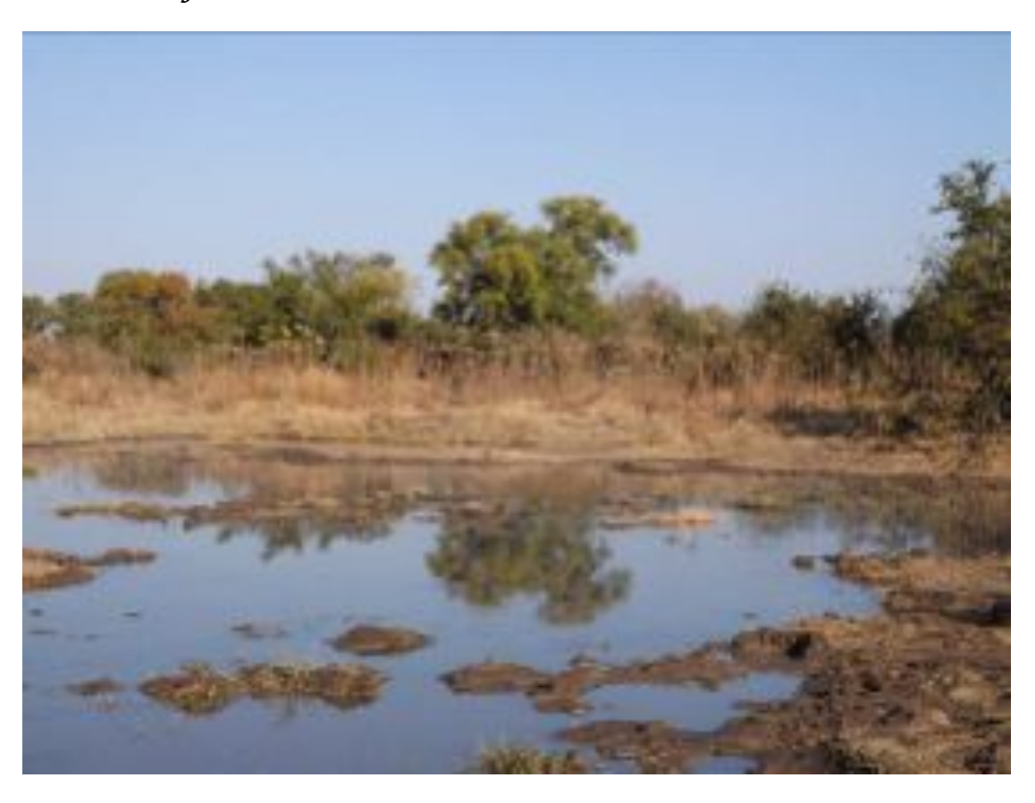
.....and after seven days of pumping. – A PAN IS BORN!!